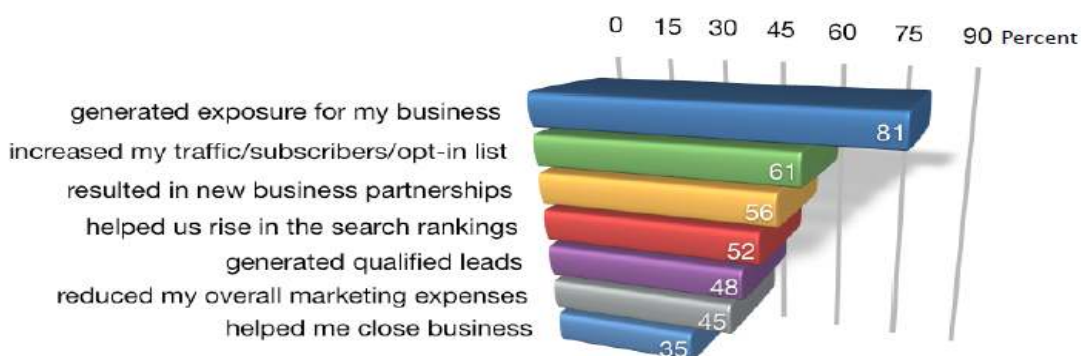
Chart 1: Benefits of social media marketing